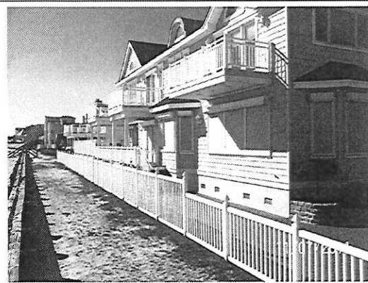
Left Side View – Date of Photograph: (See Photo Stamp)